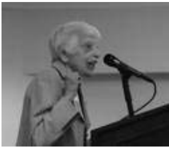
Ellen's Acceptance Remarks